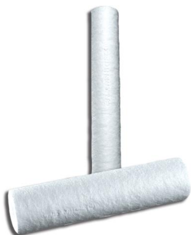
Figure 1: Purtrex Depth Cartridge Filters